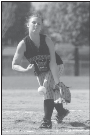
High school fastpitch