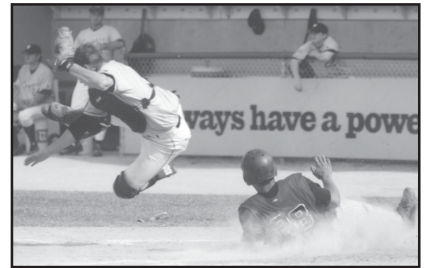
High school baseball