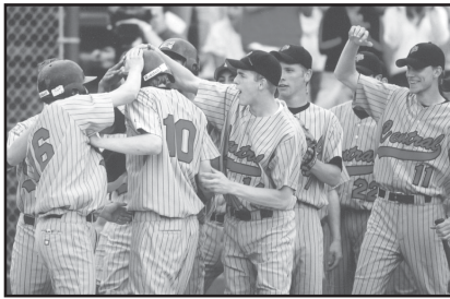
High school baseball